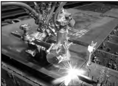
TRACER GUIDE Part No: 60038959

Koike 100 series cutting tips are recommended for best performance. Lifetime warranty on torch against a sustained flashback when using genuine Koike cutting tip. (damaged tip and torch must be returned)