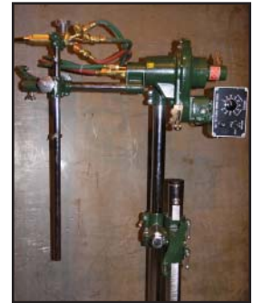
Inclined Plate Cutting

The specially designed stand allows stability and flexibility in the field. Vertical position is easily obtained by turning the handle on the stand. Cutting precision can be achieved from 0-45° inclines by adjusting the arm joint to ensure torch position.